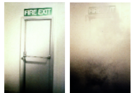
Smoke can travel at a speed of over 2m/s (5 mph). This is faster than the probable escape speed of an occupant.

Except in very small areas, there would now appear to be little justification for the suggestion that vents should not be open before sprinkler operation.